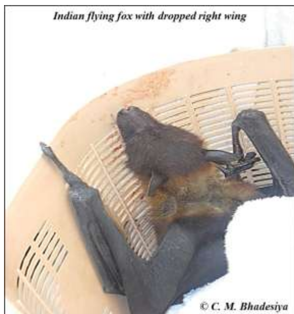
Figure-01: Rescued Indian flying fox

Clinical examination: Physical examination revealed normothermia, normal respiration, intact left wing, presence of blood clots over radial area on right wing, dropped appearance of right wing, bird being unable to fly.