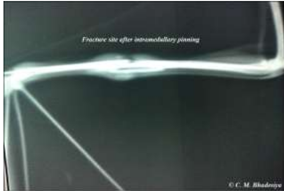
Figure-03: Intramedullary pin placed inside the fractured segment

combination @ 25 mg/kg b.wt. intramuscularly which was continued as once daily for 7 consecutive days. Meloxicam oral drop formulation was prescribed to rescuer @ 2-3 drops/day for 5 consecutive days. For improvement in basal metabolism, rescuer was also advised to use syrup containing amino acids @ 2 drops/day for 5 consecutive days. Passive range of motion technique of physiotherapy for the wing after 3-4 days post-operatively was recommended to rescuer.